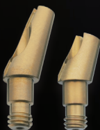
20° Threaded post