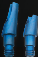
10° Threaded post