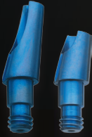
10° Threaded post