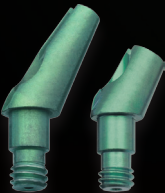
30° Threaded post