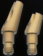
20° Threaded post